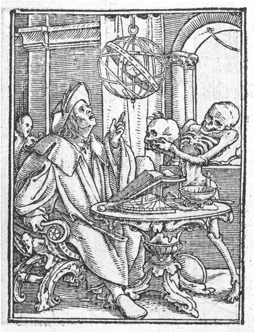
FIGURE 4A Astrologer. Woodcut by Hans Holbein as printed in Melchior Trechel, Les simulachres et historiées faces de la mort autant elegamment pourtraictes, que artificiellement imaginées (Lyon: 1538).