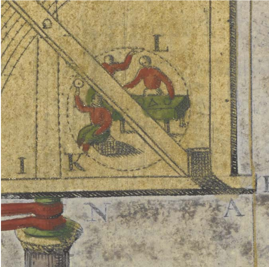
FIGURE 3 Detail from Tycho Brahe's small brass quadrant, showing an emblem inscribed within the arc of the quadrant. From Astronomiae instauratae mechanica (1598).

When the image is examined with a view to identifying those features mentioned in the description, it quickly becomes clear that the description is far more detailed than the illustration. It is difficult to know to what extent Tycho's illustration accurately reflects the emblem engraved on the physical instrument, or to what degree this description records that image. In any case, the illustration can only be regarded as a rather rough rendering of the somewhat elaborate picture verbally described by Tycho, reinforcing the importance of considering image and text in conjunction.