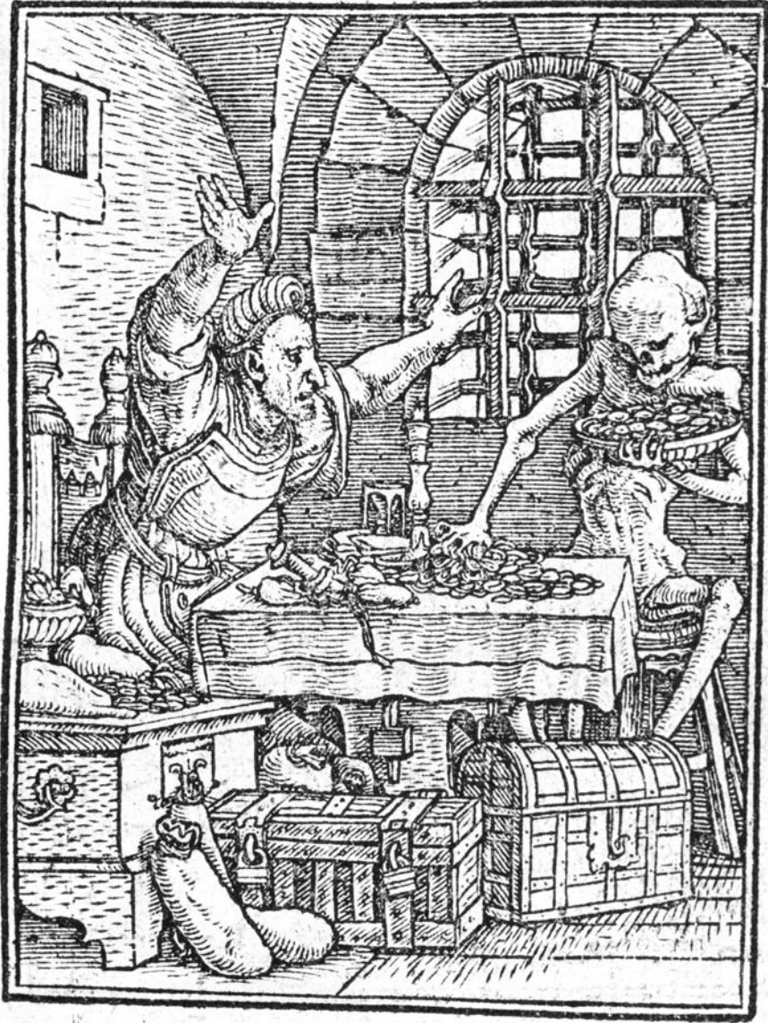
FIGURE 4B Rich man. Woodcut by Hans Holbein as printed in Melchior Trechel, Les simulachres et historiées faces de la mort autant elegamment pourtraictes, que artificiellement imaginées (Lyon: 1538). © The British Library Board, General Reference Collection 684.d.35.