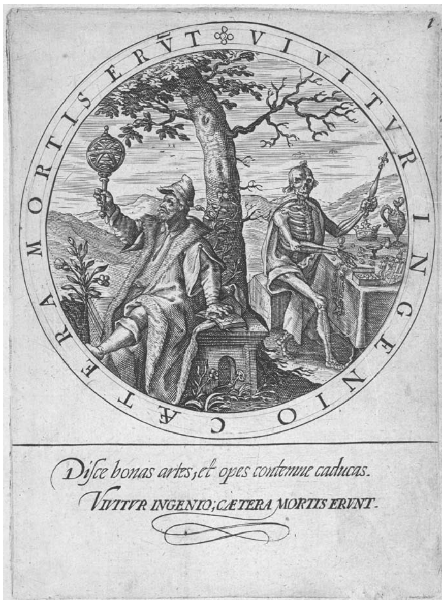
FIGURE 5 Vivitur ingenio caetera mortis erunt; emblem number 1 in Gabriel Rollenhagen's Nucleus emblematum (Cologne: 1611).