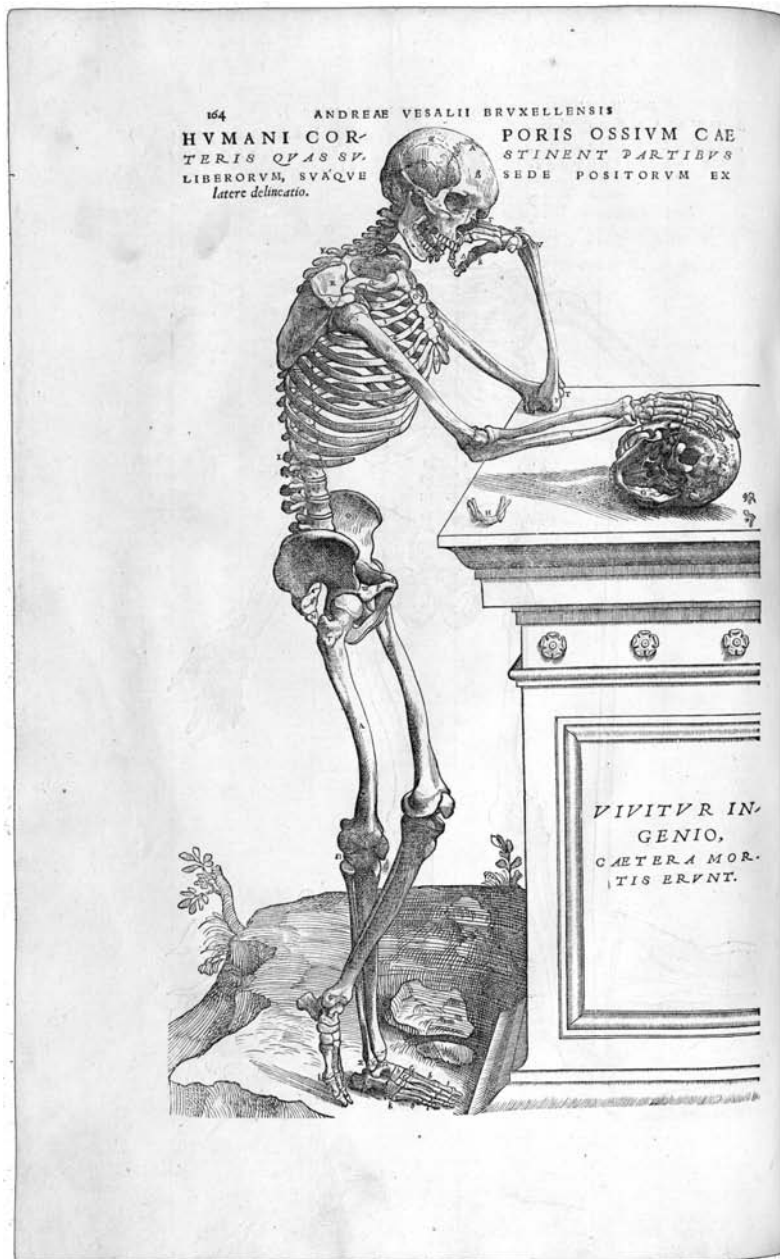
FIGURE 2 Figure of an articulated skeleton in Vesalius's De fabrica (Basel: Johannes Oporinus, 1543), featuring the motto "Vivitur ingenio caetera mortis erunt." Reproduced by kind permission of the Syndics of Cambridge University Library, N*.1.2(A).