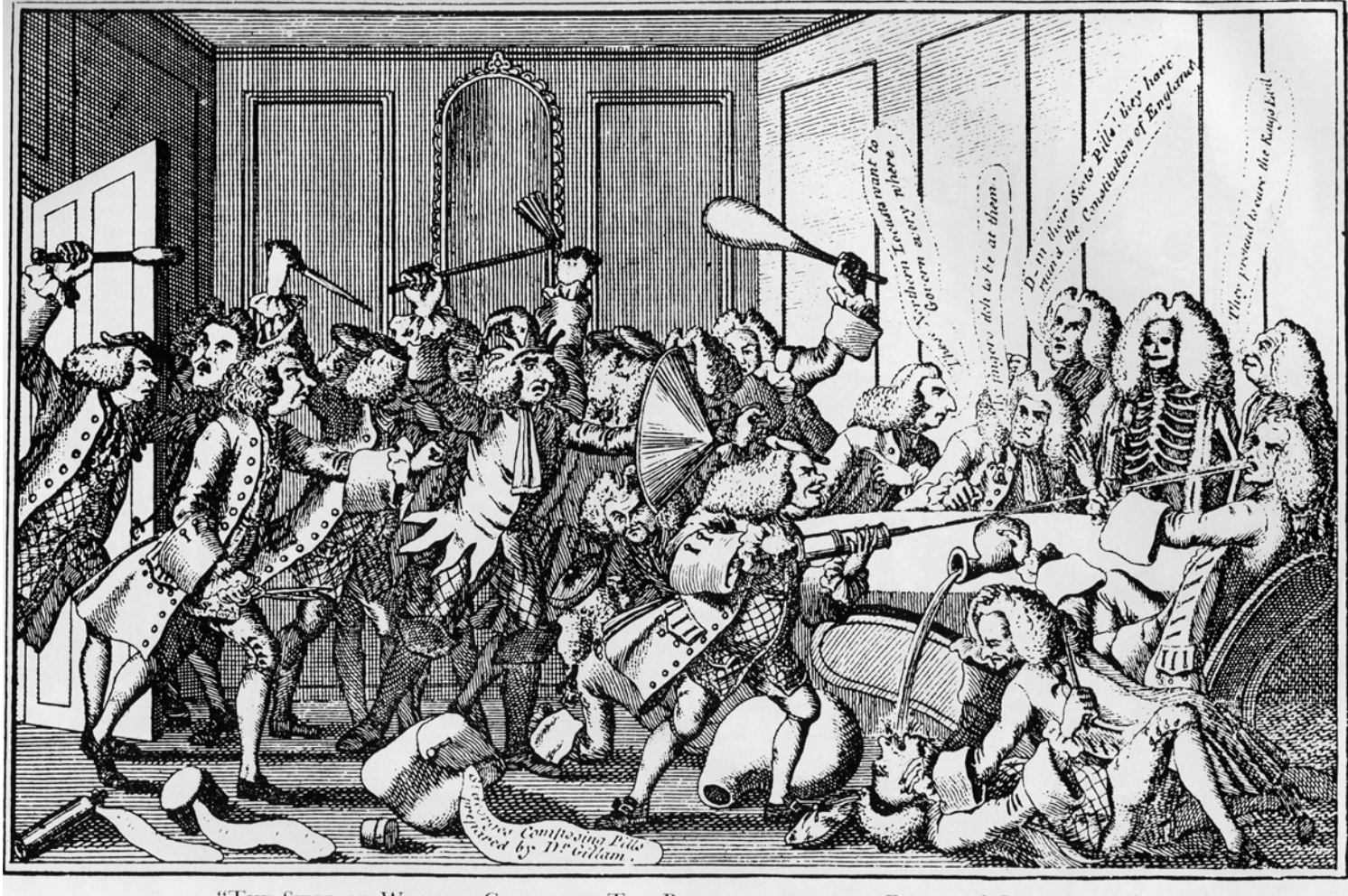
"The Siege of Warwick-Castle; or The Battle between the Fellows & Licentiates." Portrayal of riot at Royal College of Physicians, 1767