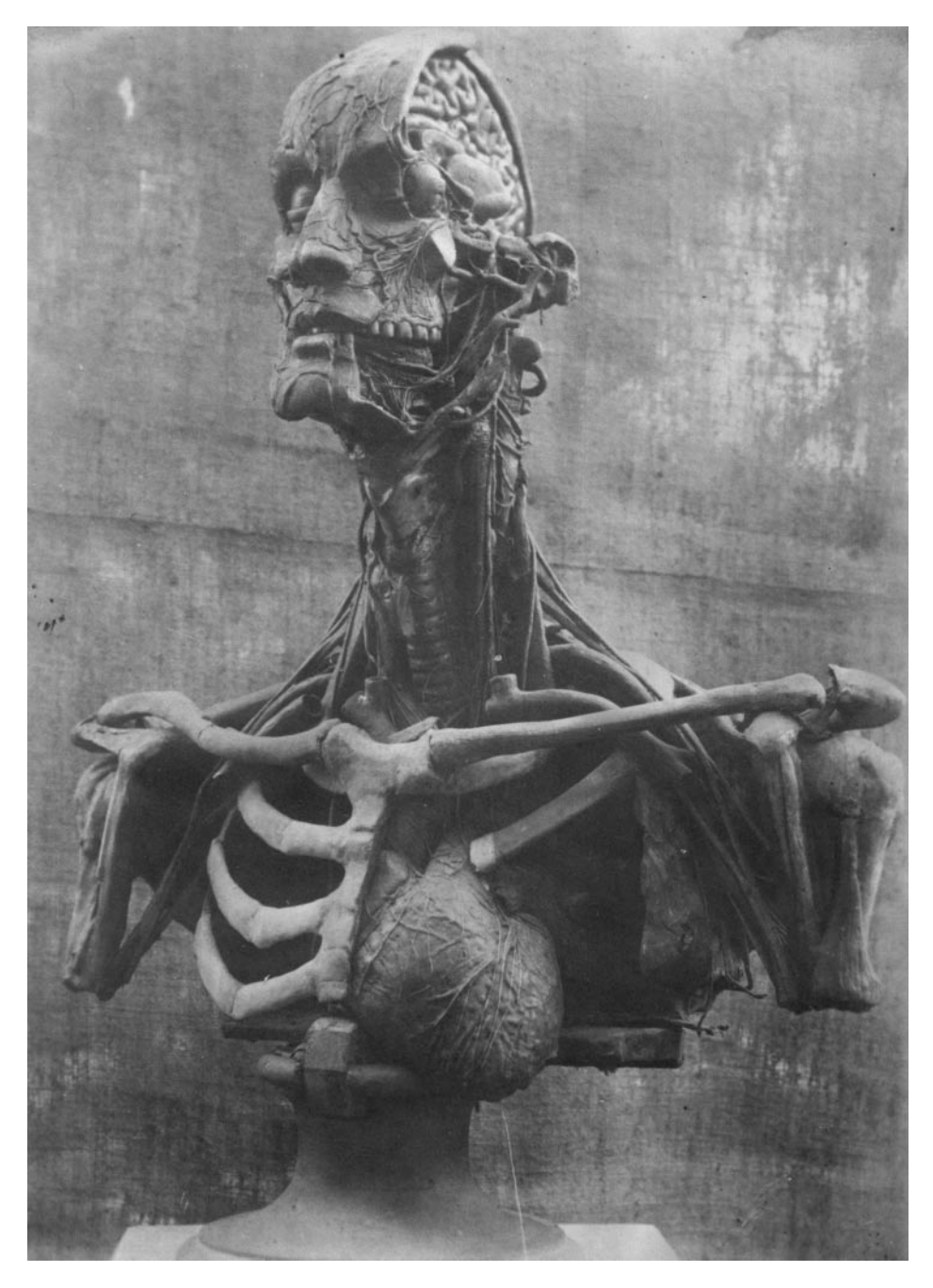
Figure 5: Photograph of an "[e]nlarged anatomical head modelled by Paul Zeiller I in the year 1860–1864 in Munich", possibly the most dissected in a series of three enlarged male busts displayed in his anthropological museum: Führer durch die Säle des anthropologischen Museums , Munich, 1862, pp. 40–2. From 'Ehren-Buch der Familie Paul Zeiller II', c. 1918, courtesy of Elsbeth Schramm.